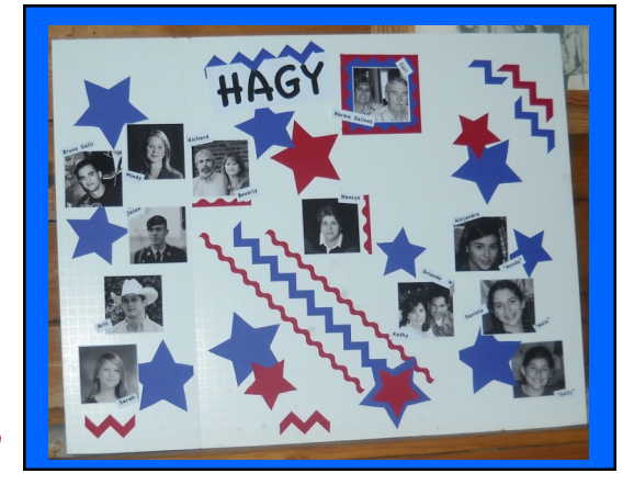
Norma's creation was appropriately very 4th of July-ish!