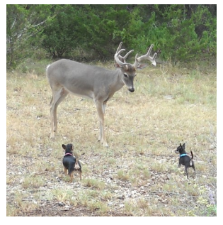
A friend's Chihuahuas try to intimidate a goodlooking buck in front of the law office where I work! Yeah, sure!