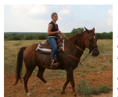
Looking good, girl!