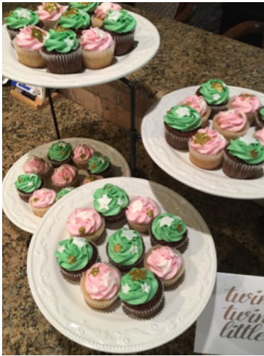
....and the yummy cupcakes & cookies were made by Bake Genius (Renee Gonzalez)!