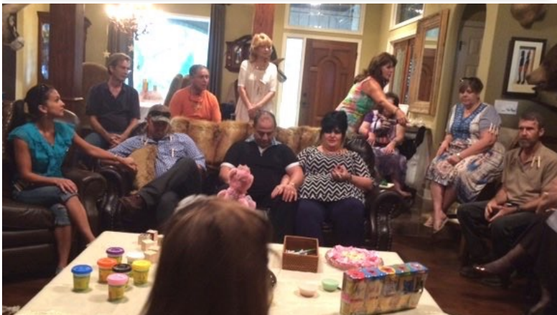
A short prayer started the party off right!