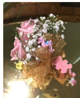
A pretty corsage for the pretty mom-to-be!